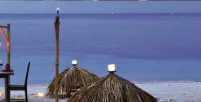
ROMANTIC PRIVATE BEACH DINNER Romantic dinner arrangement for two