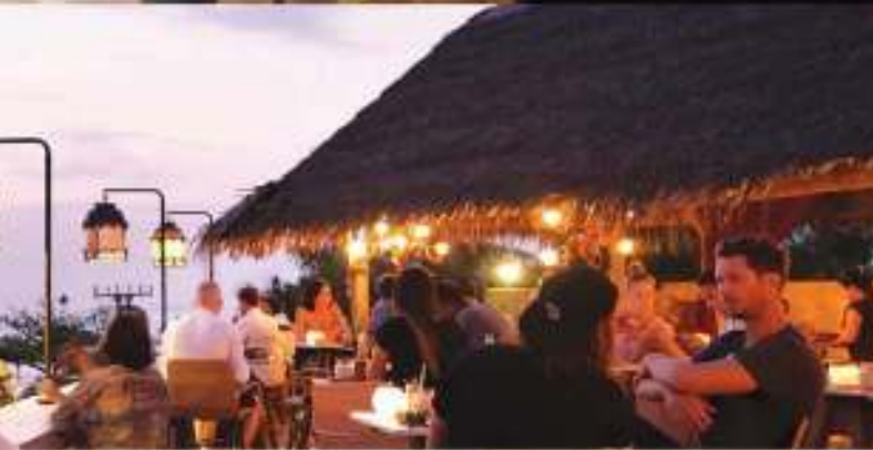
JI AT BALE SUTRA & JI TERRACE BY THE SEA Winner - Best Japanese Restaurant in Bali 2017-2019