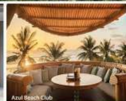
Azul Beach Club