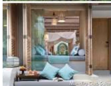
Mandira Club Suite